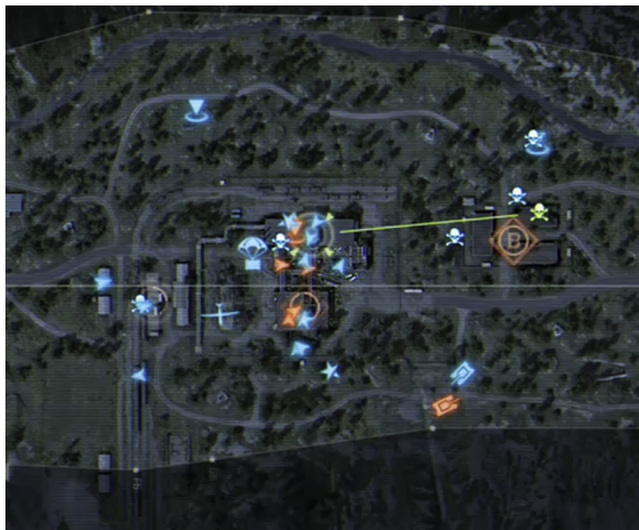
Fig. 13. Captured video from Game DVR.

A more thorough examination of the Xbox Live network is needed. There are many other applications and games that need to be tested. Additionally, there is a mobile phone