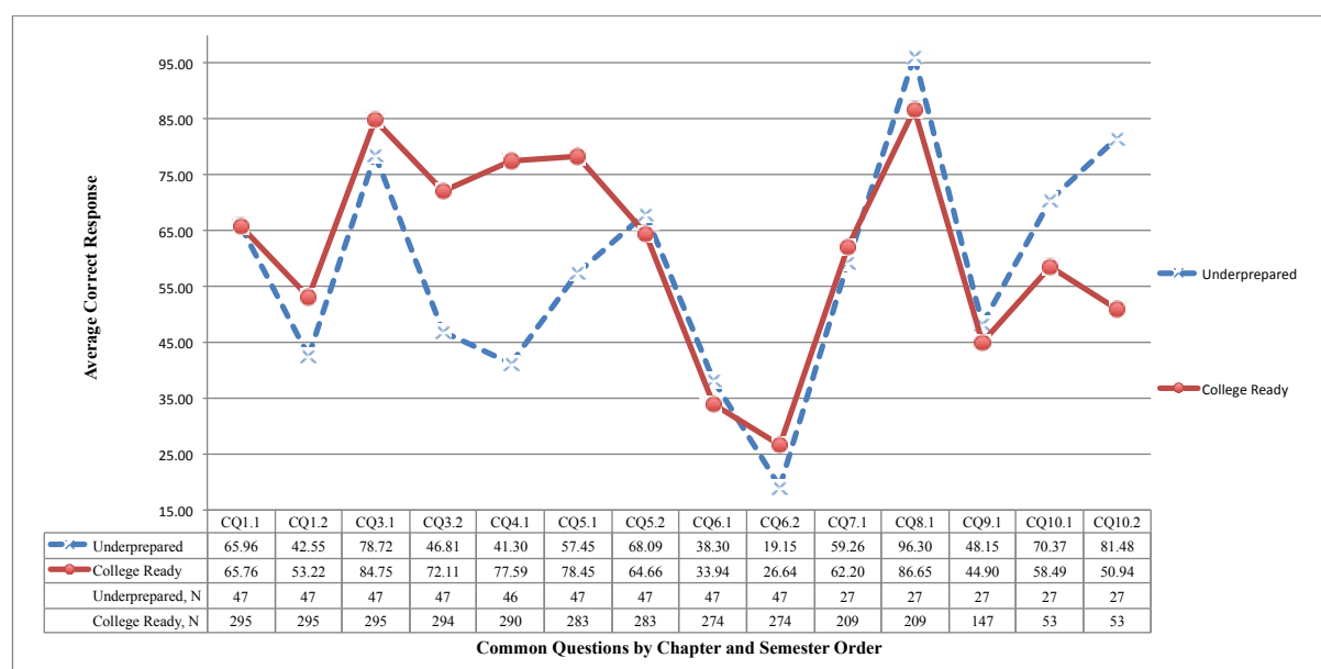
Figure 3. Percentage of correct response in common question responses graphed for students identified as underprepared and for college-ready by chapter

Common question results were also analyzed for underprepared and college-ready students within the study. The analysis was done to compare student performance over the course of the semester for those identified as college ready versus underprepared. The results were analyzed using the percent correct response (Figure 3). The results indicate that as the semester progressed, underprepared student began to outperform their college ready peers on common questions.